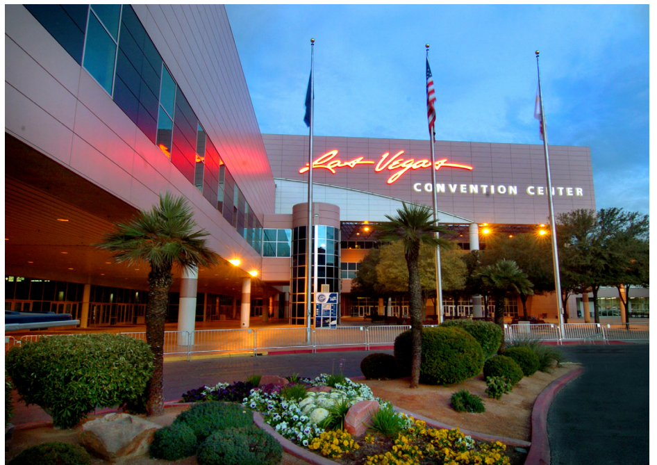
Exterior photo of the Las Vegas Convention Center